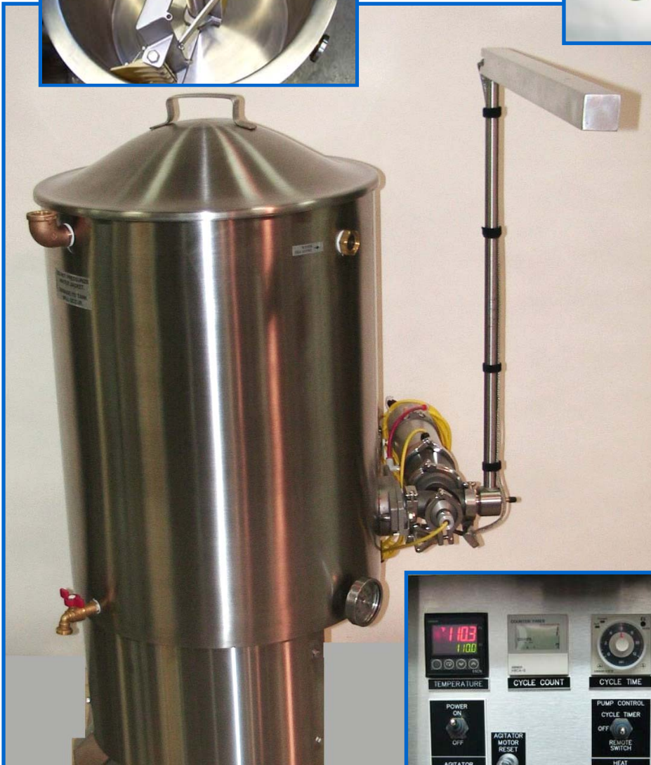
Control panel for tank and depositing pump