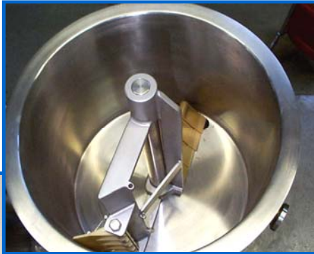
View of tank with removable agitator