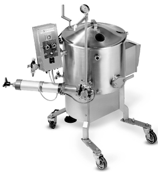
1 Nozzle Mould Depositor mounted to a 125 lb heated tank