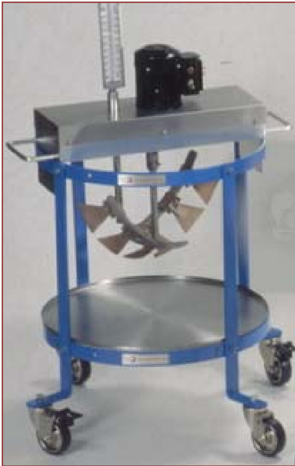
Kettle Thermometer shown is no longer available from Savage Bros. See brochure on our Wall Mounted Digital Temperature Unit.

And with the optional drip pan, the larger unit can hold the Portable Agitator while conveniently collecting the drippings off the scrapers.